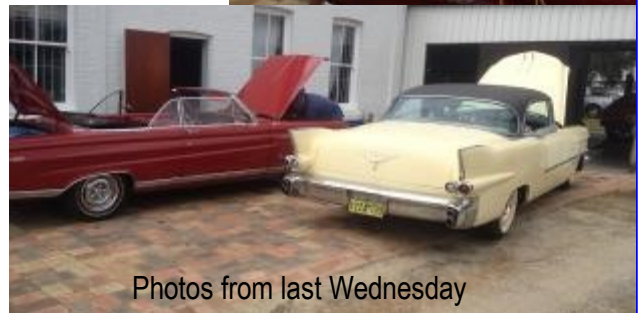
Photos from last Wednesday

This one is a challenge. Watch this space...